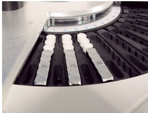
QR code ID of the strips